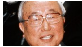
Eiji Toyoda, Driver of Global Expansion, Dies at 100