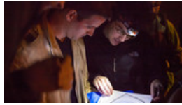
Flop at the Box Office Spawns a Generation of 'Midnight Madness'